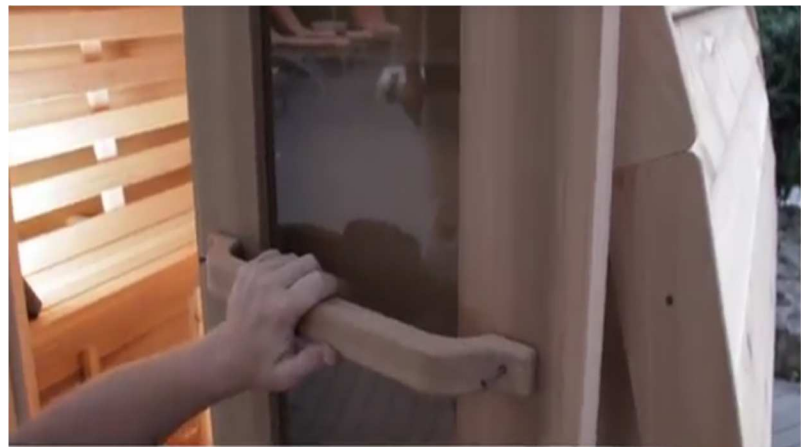
40. Measure to center of door and attach door handle using 2 1/2" screws. Make sure handle is level.