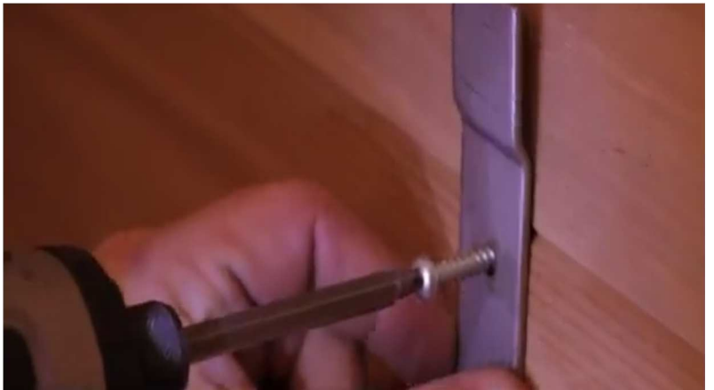
48. Mark the wall placement of the heater brackets. Secure the brackets using the screws provided with the heater.