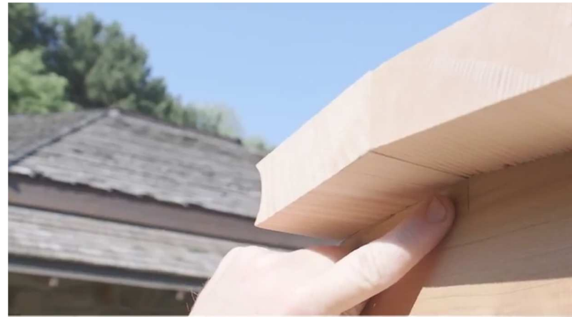
22. Using a rubber mallet, center the top piece with the markings on the front and back wall, Secure with 2 1/2" screws.