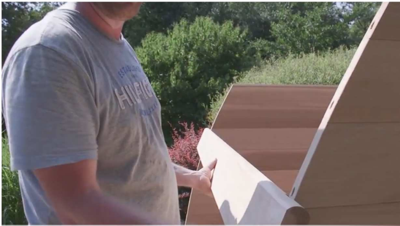
13. Secure a stave on for support in the same manner as step 11.