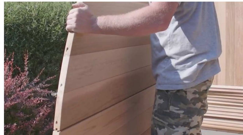
12. Attach mid-back wall onto groove. Secure with 2 1/2" screws.