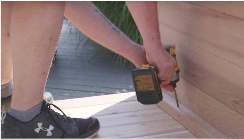
7. Secure using 2 1/2" screws.