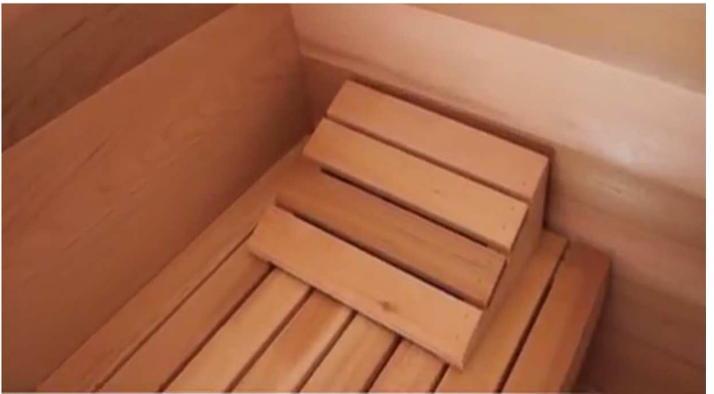
54. Lastly, place the headrests and the water bucket in the desired locations.