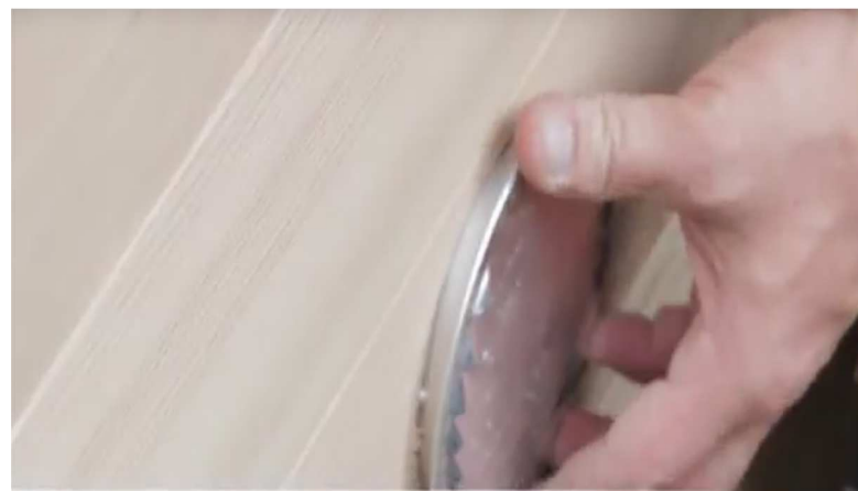
41. Insert the air vent into the opening in the back wall, securing it with 1 1/2" screws from the inside.