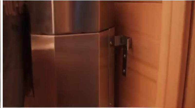
50. Place heater on wall brackets.