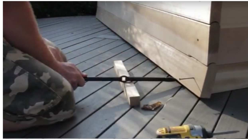
26. Attach bottom stave using a crowbar and rubber mallet, finesse into place. Secure with 2 1/2" screws.