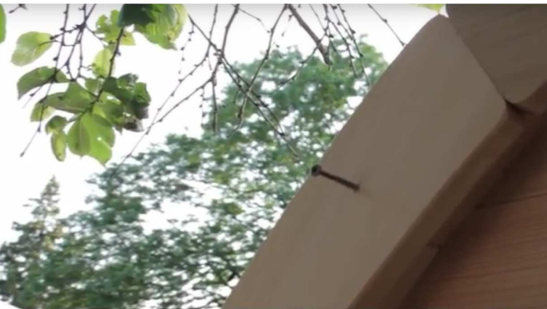
29. Add next piece of trim to top trim piece making sure they are flush. Continue to add trim pieces in this manner on all sides.