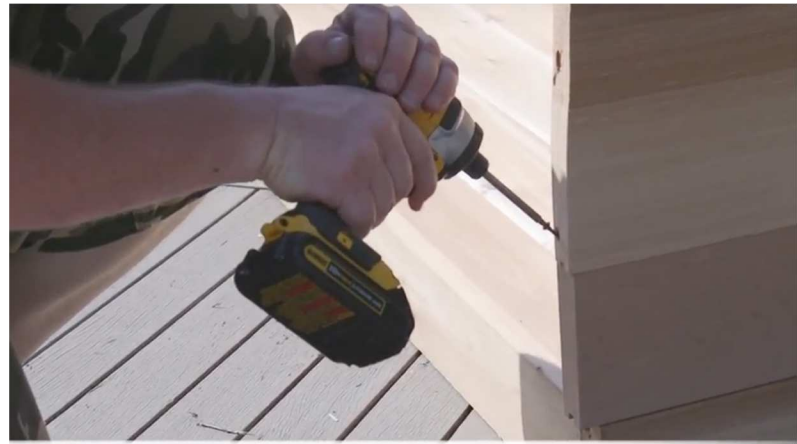
10. Secure with 2 1/2" screws on both sides.