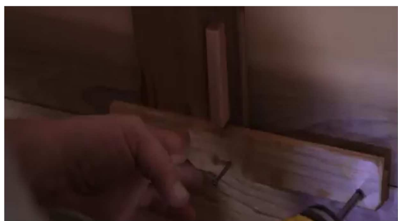
42. Using the cover as a guide, line up the lower rail and secure with 1 1/2" screws.