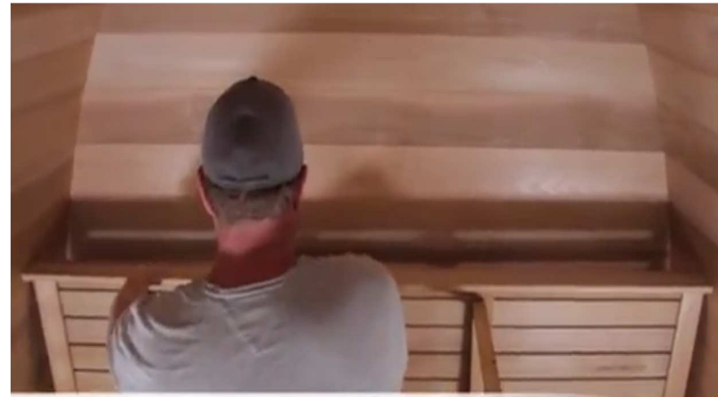
44. Attach the bench supports to the underside of the benches, evenly spaced and flush with front trim.