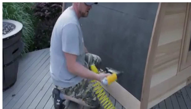
35. Attach the beveled siding, smooth side out, thinner side up. Make flush with the bottom of floor.