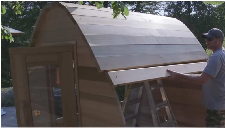
25. Move the support staves up and secure. Continue adding staves on both sides.