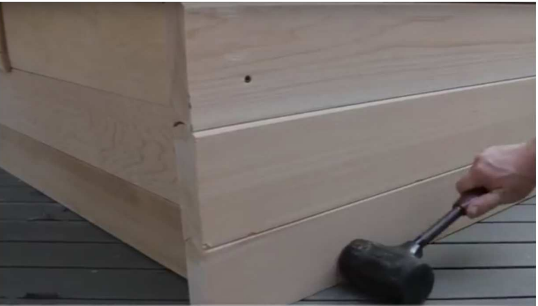
27. Repeat on opposite side.