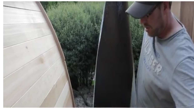
30. Attach the ice and water shield by first removing the adhesive backing.