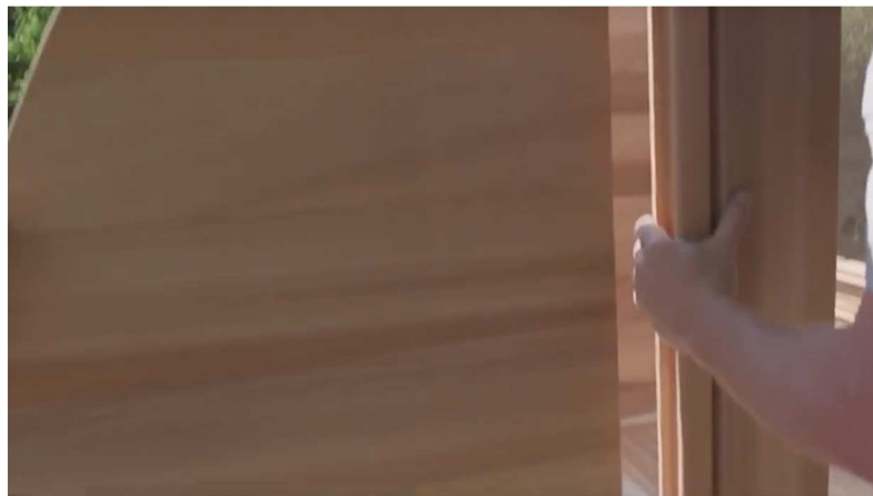
15. Slide door into place on groove. Secure with 2 1/2" screws.