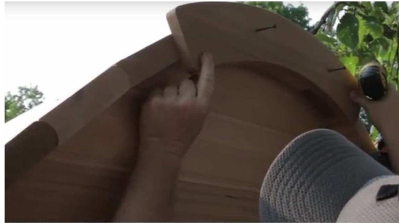
28. Center top trim piece and attach with 2 1/2" screws.