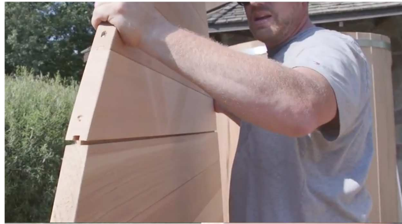
14. Attach top back piece with 2 1/2" screws.