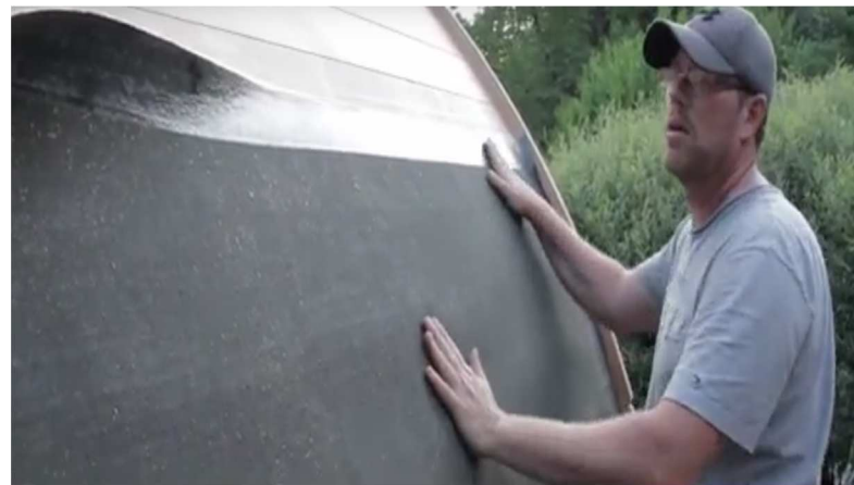
33. Repeat on both sides until fully covered.