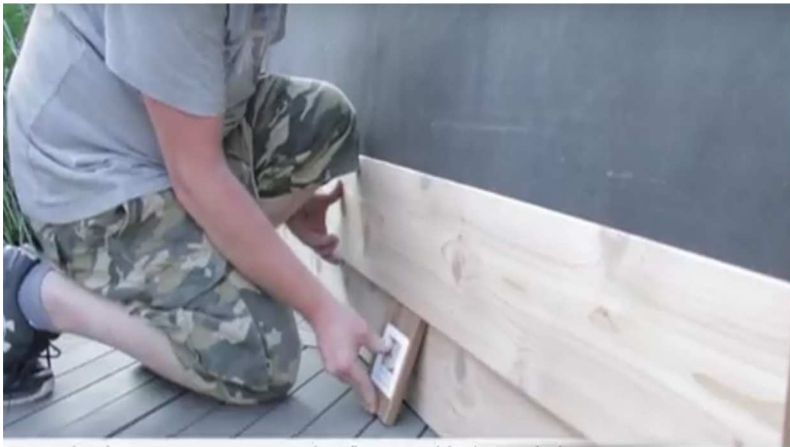
37. Using the 6" spacing block provided, attach subsequent pieces.