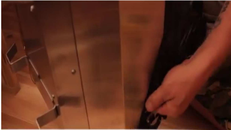
49. Remove the protective film from the heater before use.