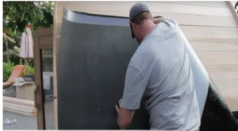
32. Apply the next piece in same fashion overlapping the reflective part of the lower piece.