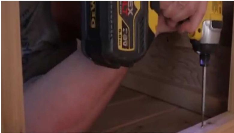
45. Using 2 1/2" screws, secure bench to floor and walls.