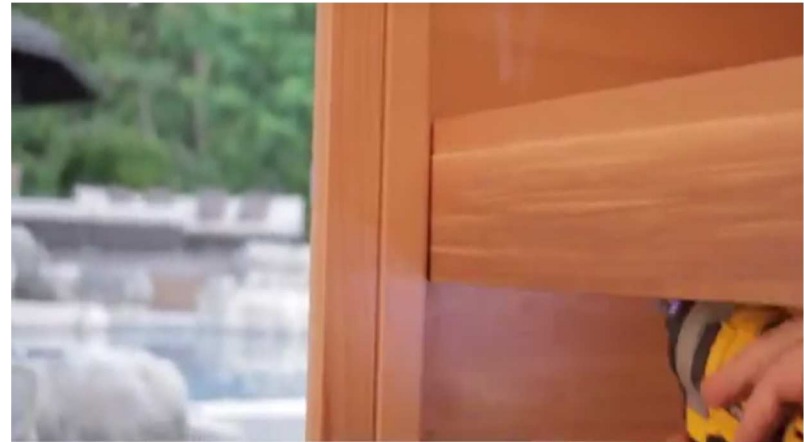
46. Make left bench flush with door frame.