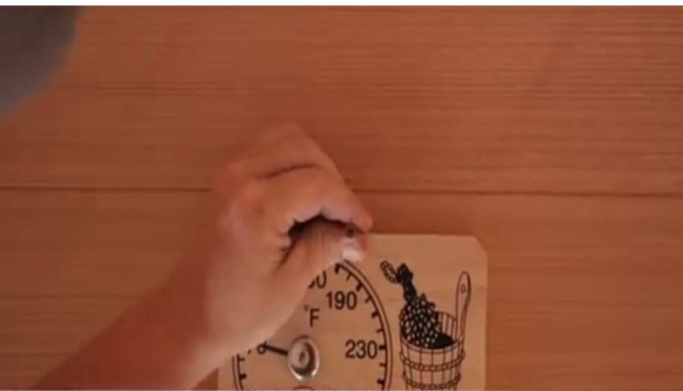
53. Install the thermometer centered above the door using a 1 1/2" screw.