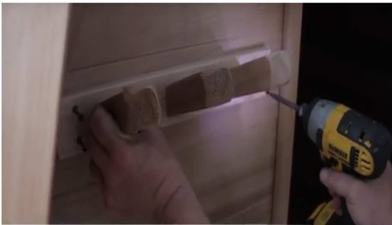
39. Attach towel rack left of the door with 2" screws.