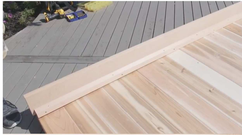
8. Repeat for front wall support.