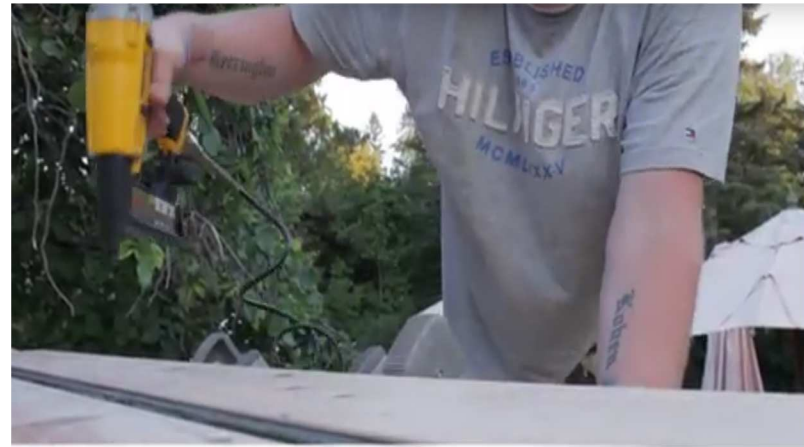
38. Repeat to the top of both sides and cap off with the last board on the peak.