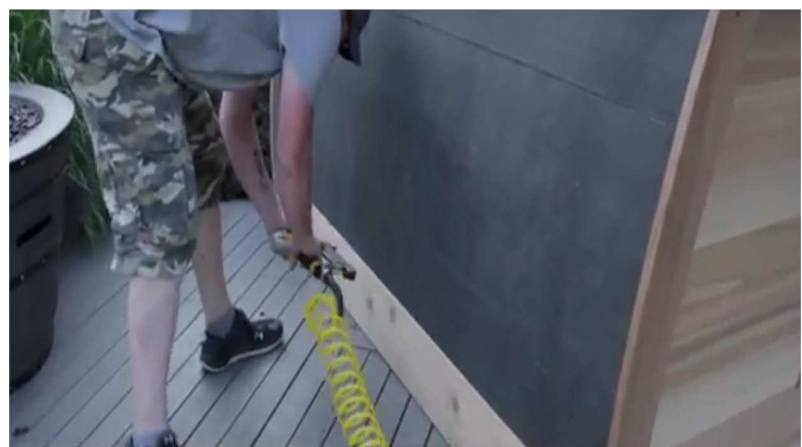
36. Secure in place using rust-proof staples or cedar shingle nails every couple of feet