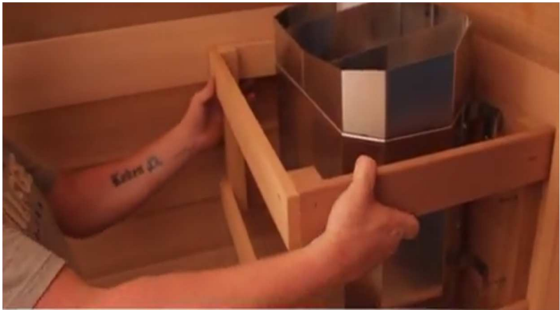
52. Attach heater guard to wall using 2 1/2" screws.