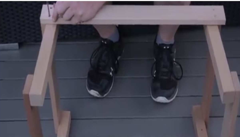
51. Assemble the cedar heater guard using 2 1/2" screws as shown.