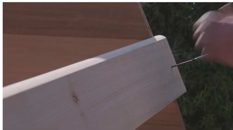
18. Attach support staves in same manner as in steps 11 & 13.