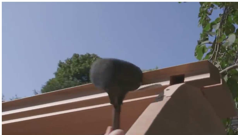
23. Attach Staves using a rubber mallet and tapping block to finesse into place, secure with 2 1/2" screws.