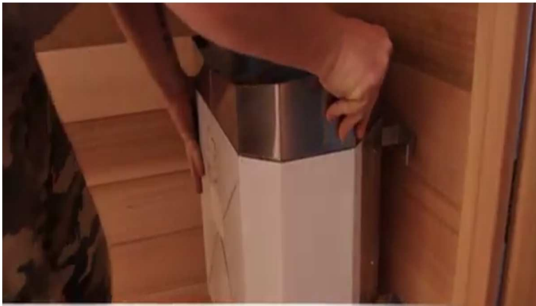
47. Place the heater on top of the "box of rocks" to install at the correct height.