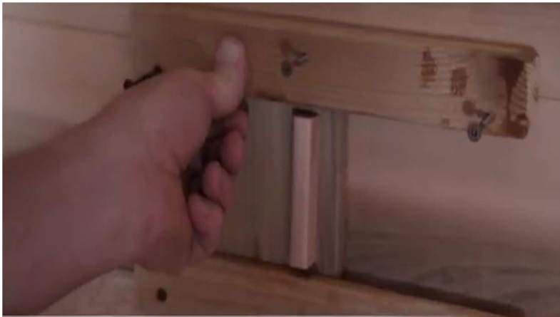
43. Make sure when securing the top vent cover rail that the vent cover can still move with ease. Be careful not to overtighten.