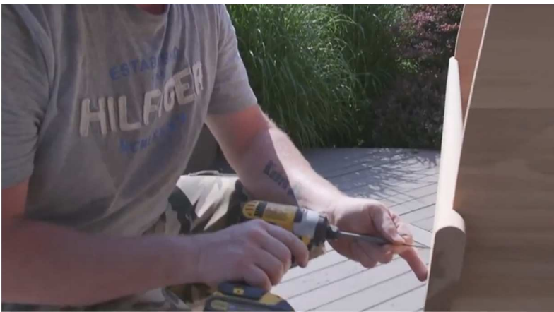
11. Use a stave for support, screwing it on securely. Make sure stave is at same level on front and back wall.