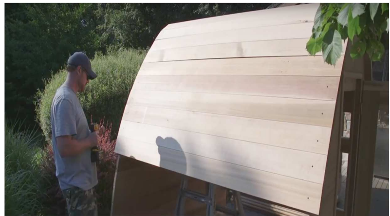
24. Attach staves from top to bottom on both sides.