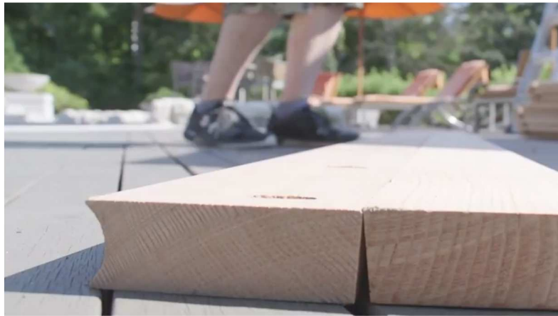
21. When the front and back walls are fully in place, assemble the 2 top boards using 2 1/2" screws.