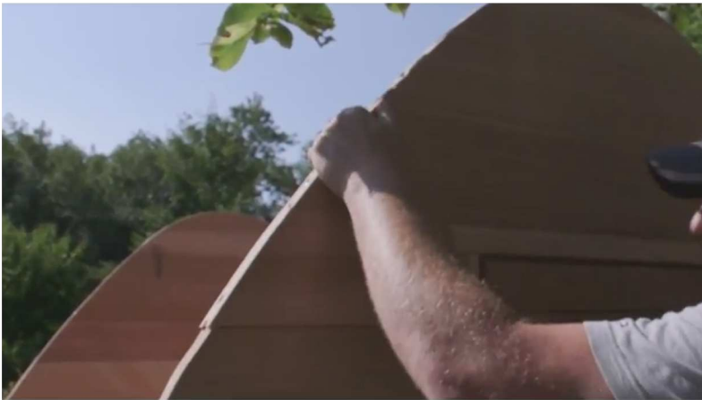
19. Attach front top piece onto groove and secure with 2 1/2" screws. A little overhang is normal and will be covered by staves.