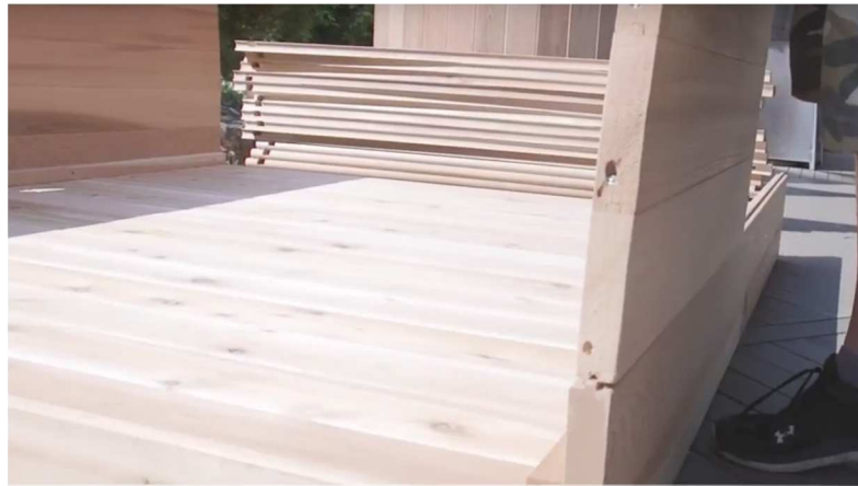
9. Attach front left wall flush with groove.