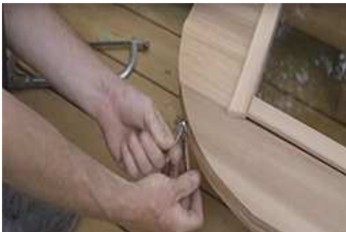
Tighten other side and cut off excess with hacksaw.