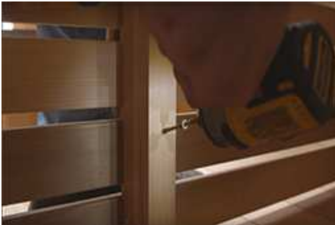
Secure the bench brackets to the bottom bench covers as shown using 2 ½" screws.