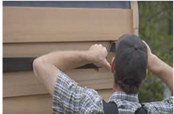
Cut off the excess at the bottom with a utility knife as shown.