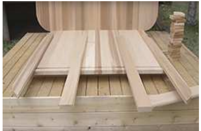
Gather all the front wall pieces and lay out like above.