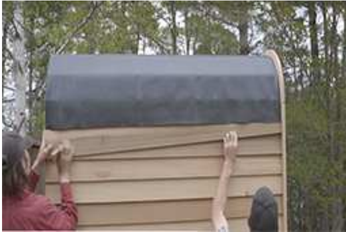
When you reach the rubber membrane, secure a shingle underneath.