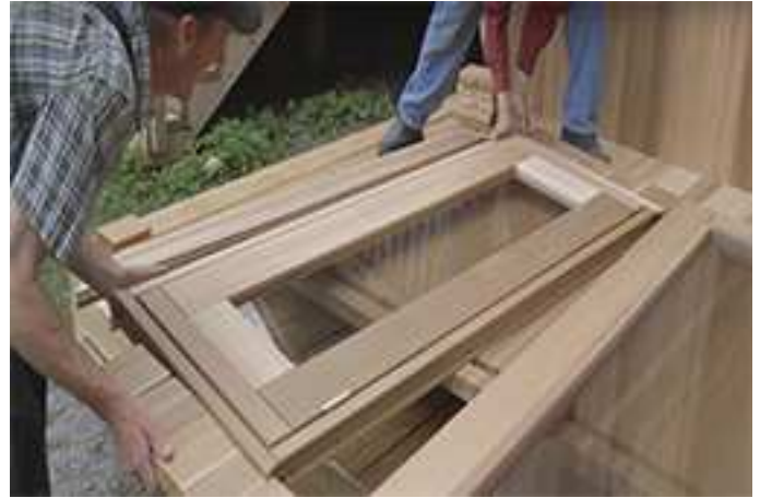
After adding 5 more small staves at the top, slide door in same manner as window.