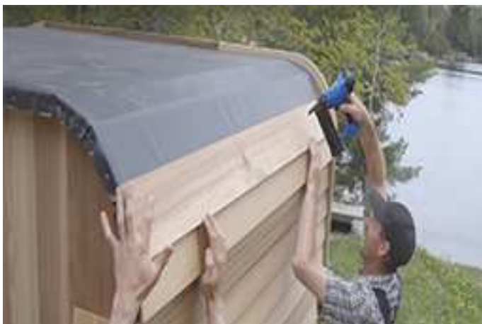
Continue add the siding until you reach the top.