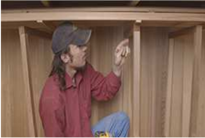
To install the inside benches, line up brackets to bench supports on top & bottom benches.