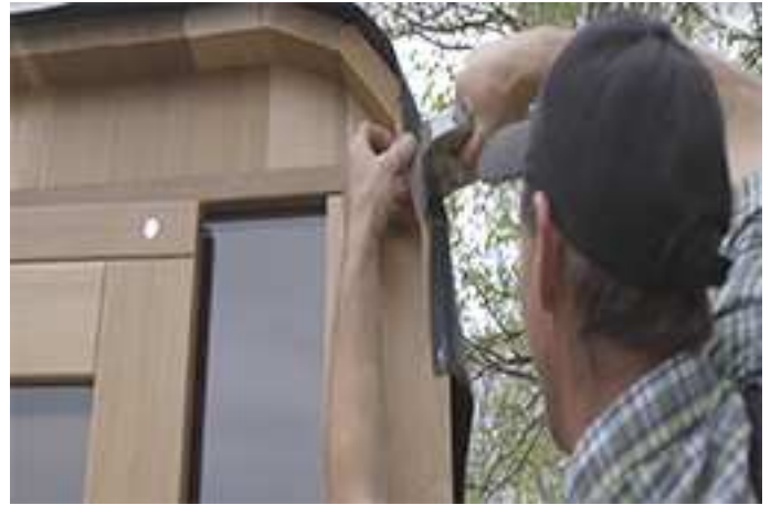
Using the staple gun, secure the rubber membrane to the front of sauna as shown.