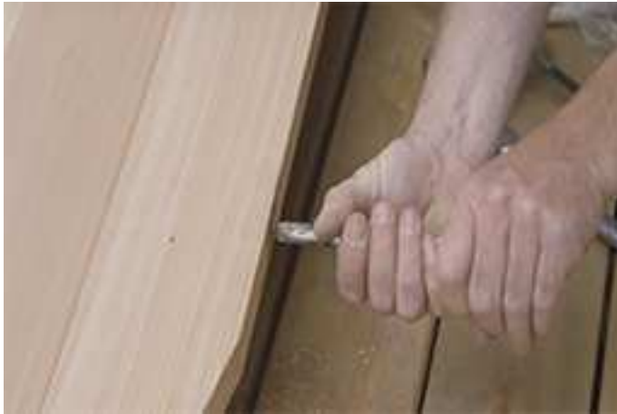
Use vice grips to safely snap off the cut piece of threaded rod