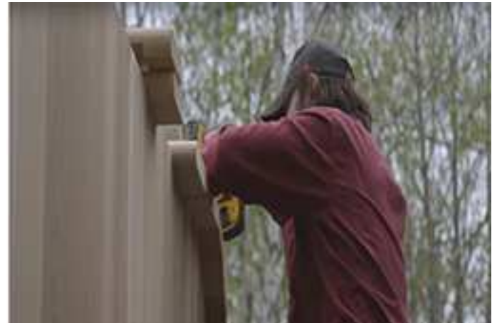
Continue adding staves in same manner as before.