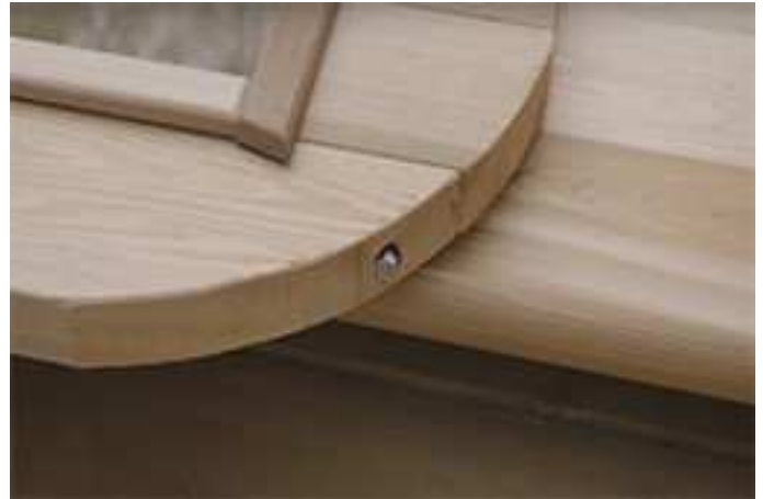
Make the nut and washer flush on 1 side