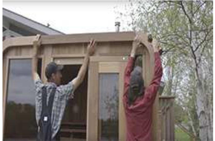
Secure trim with 2" screws.