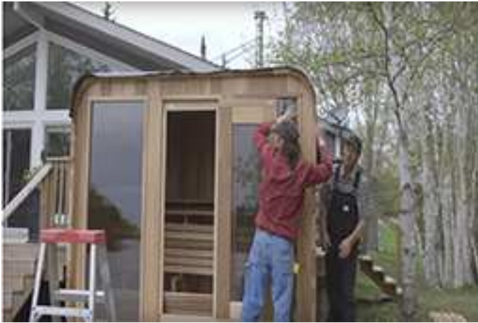
With two people, drape rubber membrane over sauna as shown.