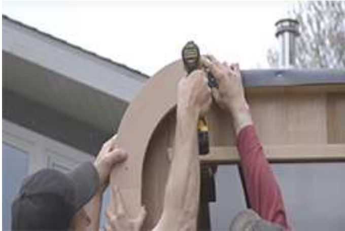
To prevent the trim pieces from splitting, pre drill the pieces first