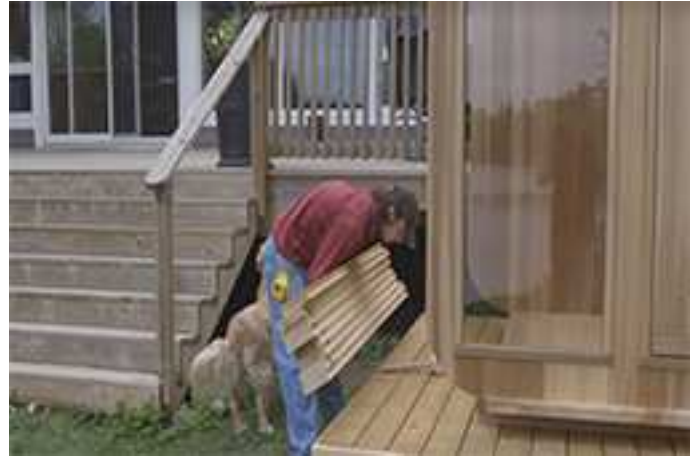
Gather side staves and place on either side of the sauna.