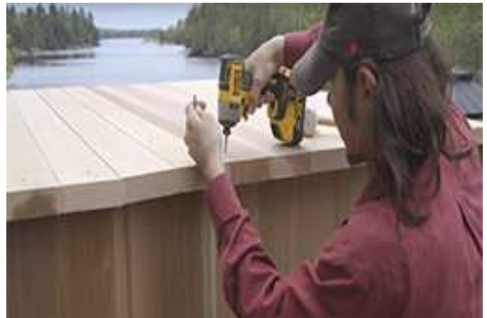
Once all the staves are in, secure each stave with a 2 ½" screw at each end.