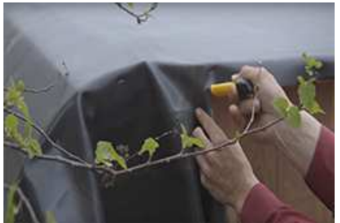
Using a utility knife, cut off the excess rubber membrane.