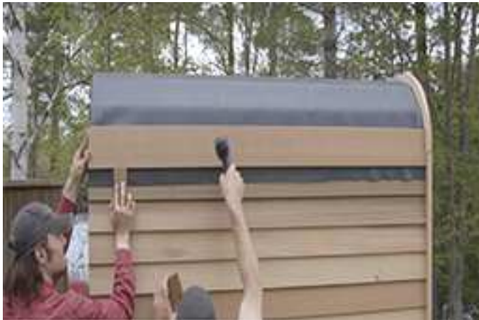
Now secure a shingle over the membrane as shown.