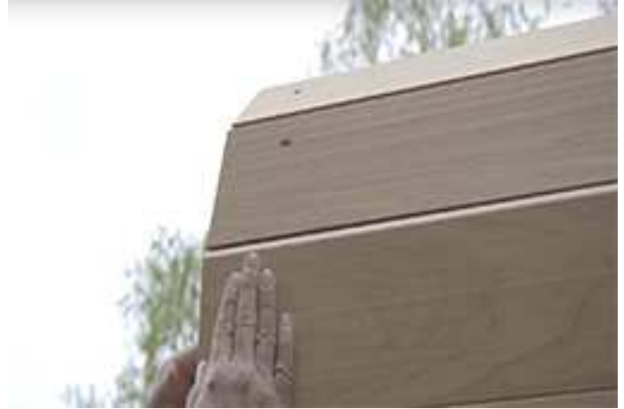
Before screwing in top corners, bang staves snug in place.