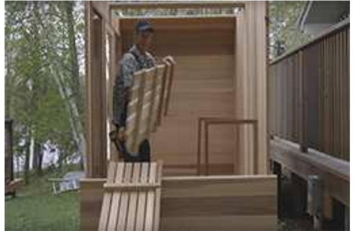
Before both walls are finished, bring in all benches and brackets for easier installation.