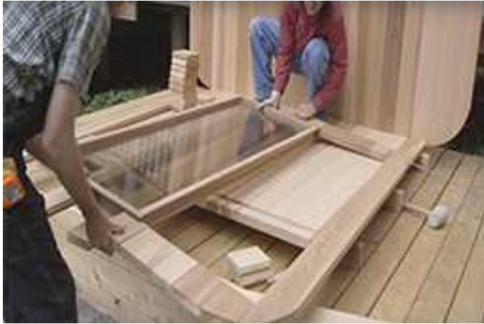
Using a helper, slide window into place.