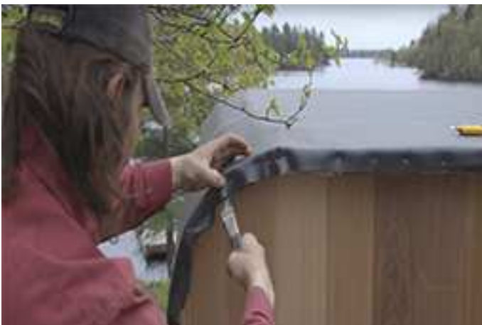
Secure both sides with more staples.