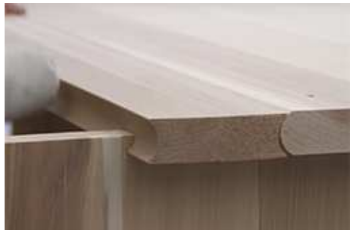
The center stave will be concave on both sides.