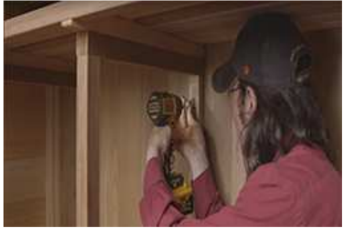
Secure the bench brackets to the wall and the bench supports using 2 ½" screws.