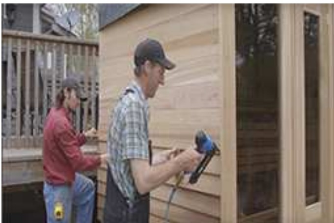
Using small nails or staples, secure each shingle at the bottom so that it catches the top of the shingle underneath.