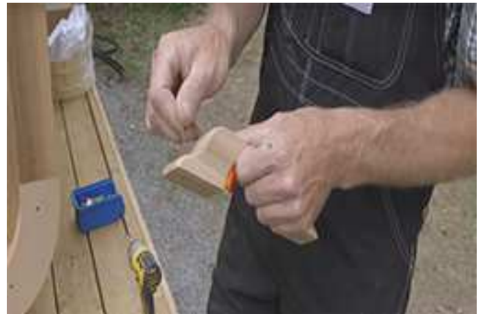
To install outside handle, pre place 2" screws as shown.