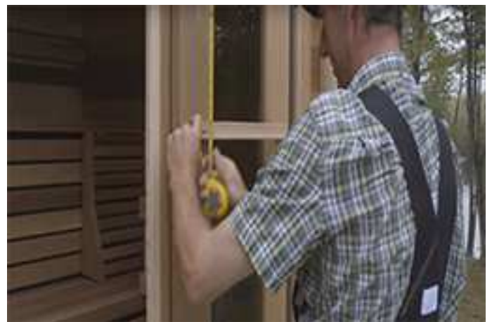
Repeat process with inside towel bar handle.