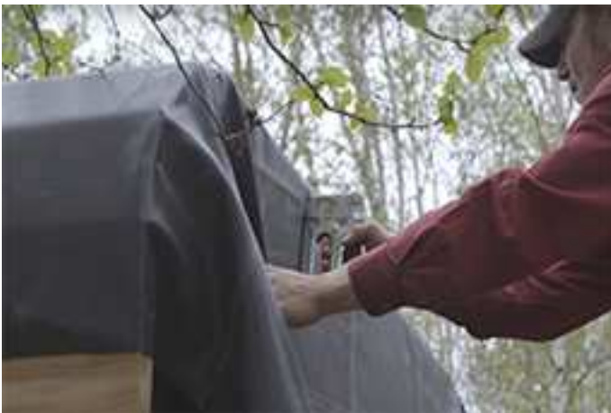
On the back, secure it as shown with the roofing membrane draping down.