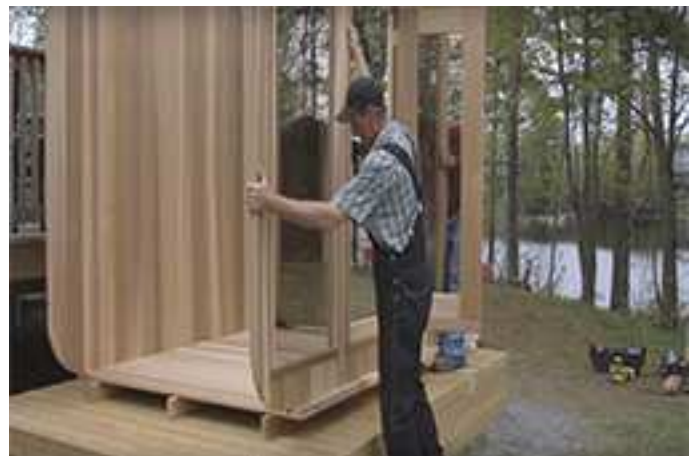
With 2 people, slide front wall into bottom staves in same manner as back wall.