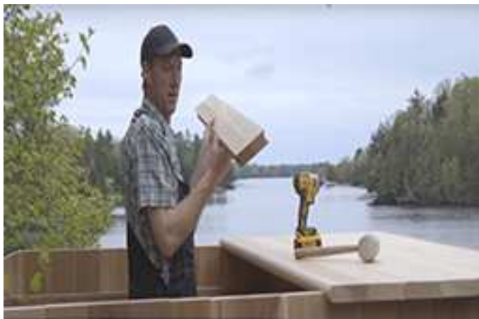
Once you reach the middle, install the center stave without screwing it in.