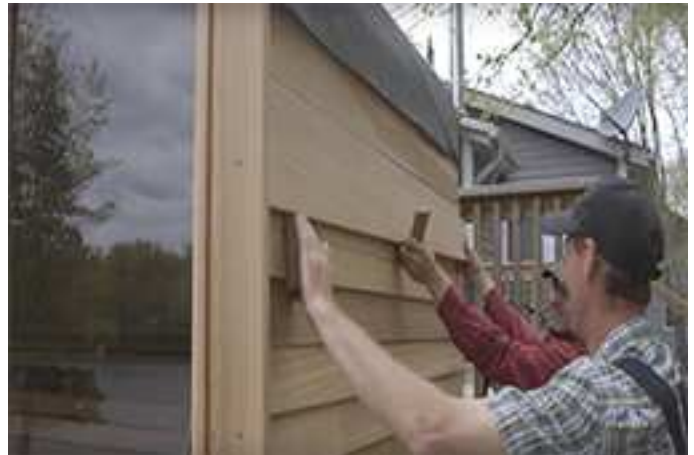
Continue process for both sides.