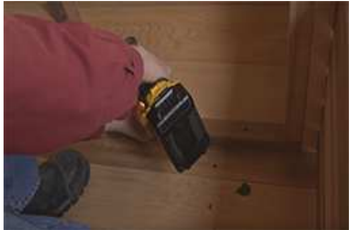
Screw bench brackets to floor using 2 ½" screws.