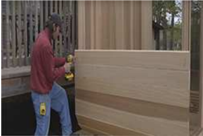
Continue to attach staves using a 2 ½" screw on each end of stave,