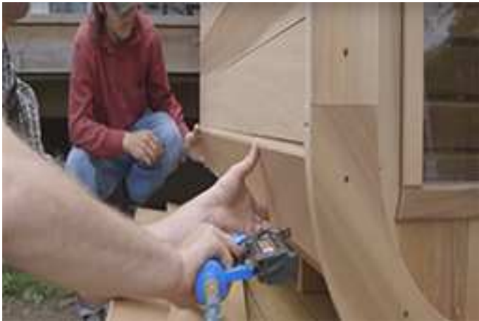
To install the siding, start at the bottom with the top of the siding flush with the bottom wall stave.