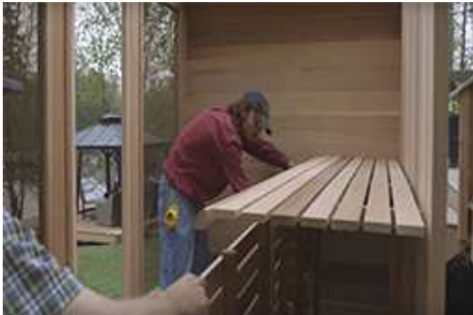
Assemble benches as best you can without securing them.