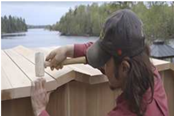
When you reach the middle, use the mallet to finesse the last pieces in.