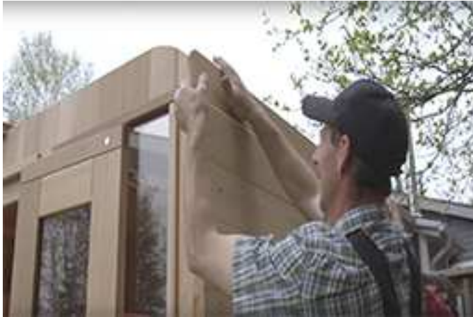
Continue to attach staves using a 2 ½" screw on each end of stave,