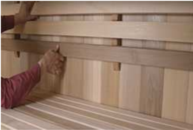
Position back support at desired height, Secure it between slats using 2 1/2" screws.