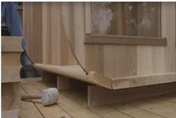
Follow the curvature of the walls.