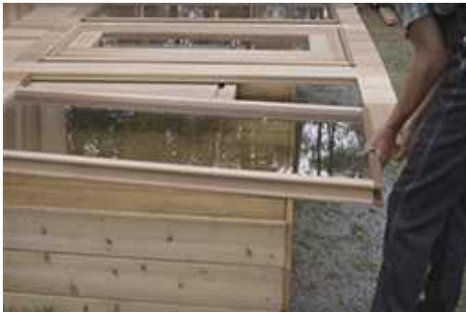
Repeat the same process for the other side window.