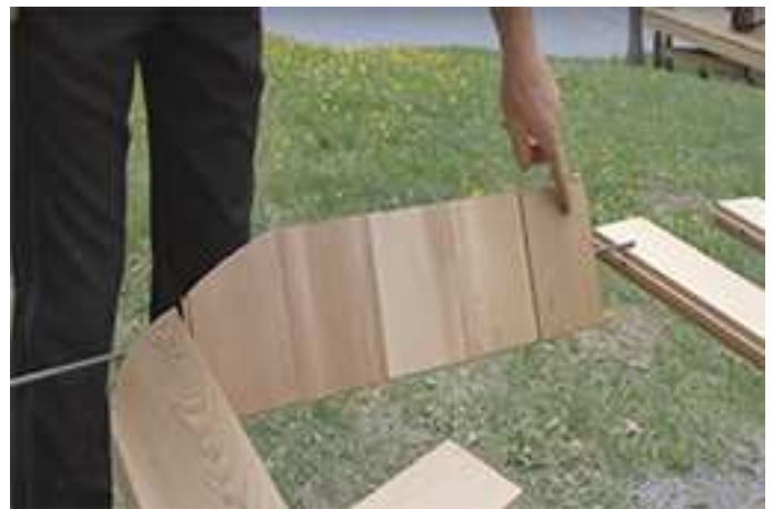
You should have 5 small staves between the corner and middle stave.