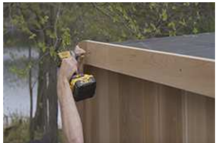
Attach the trim on the back of sauna in same manner as the front.