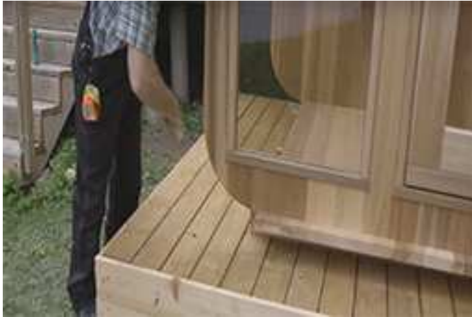
Use a mallet and tape measure to ensure front wall is centered.