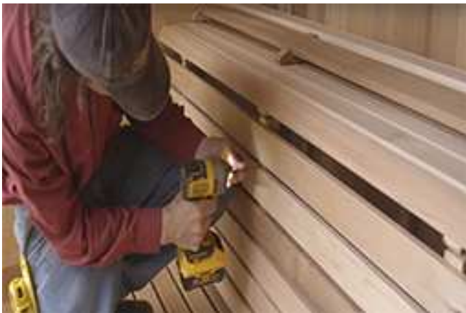
Screw in between slats to secure the upper bench cover using 2 ½" screws.