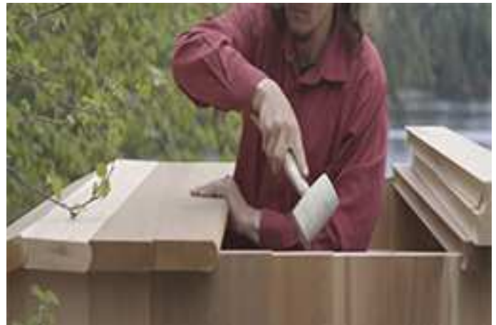
Continue adding staves using only the mallet, no screws at this time.