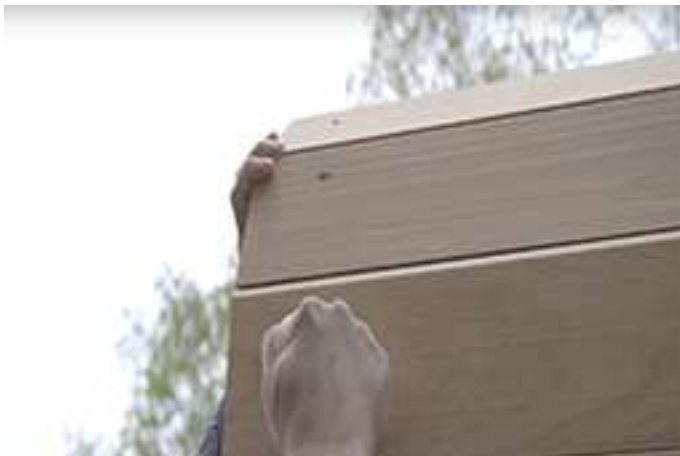
After staves are snug, screw in middle stave then the outside ones.