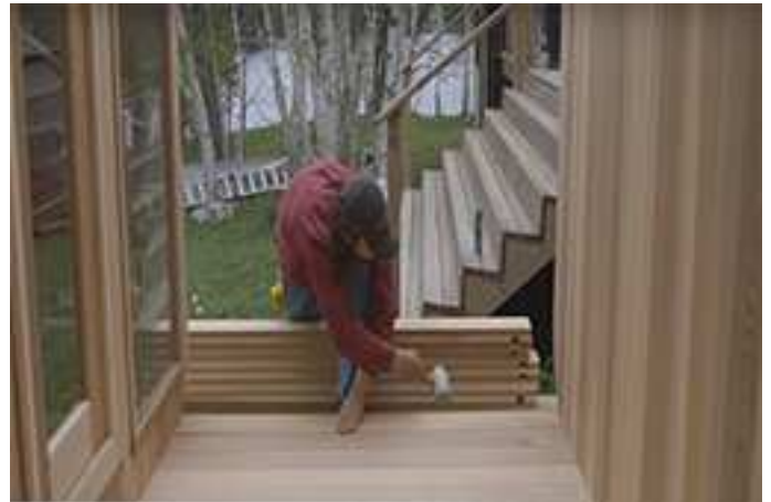
Start inserting the wall staves on both sides, starting from the bottom.