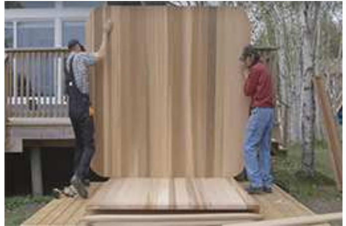
With help, Lift the back wall and insert into groove of bottom staves.