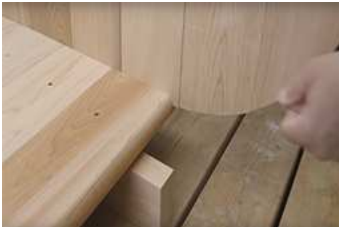
Make sure both sides are sticking out equally to ensure wall is centered.