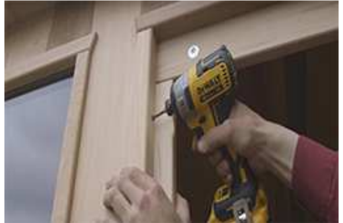
Secure the door to the frame 6" from the top and bottom of door using 2 1/2" screws.