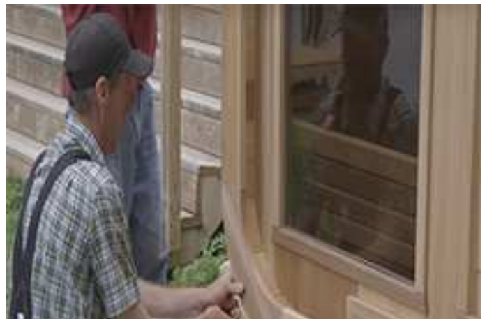
Install the sauna trim starting at the front of the sauna.