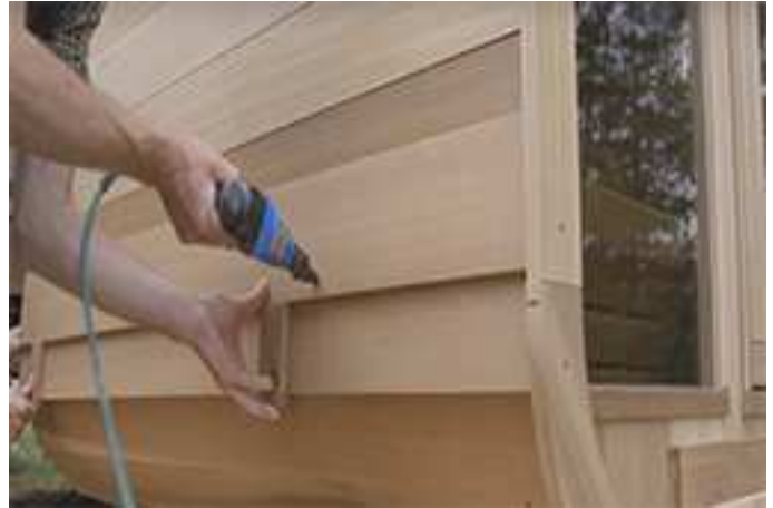
Start the next piece of siding 4" from the bottom of the previous piece.