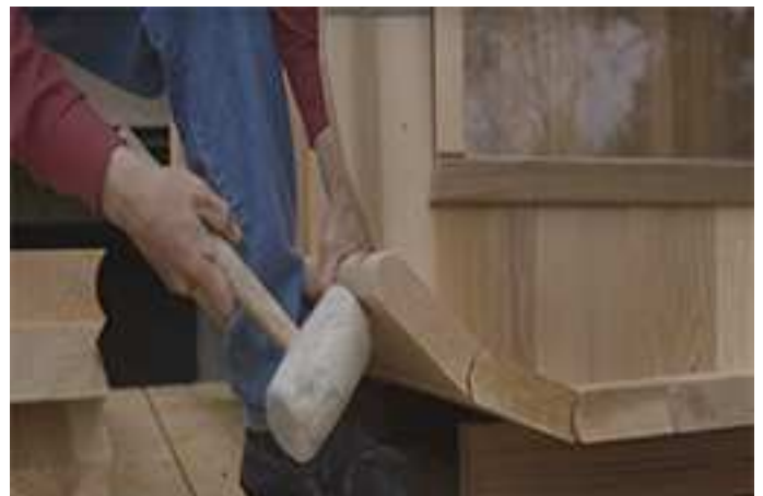
Use the rubber mallet to help position the staves and then secure with a 2 ½" screw.