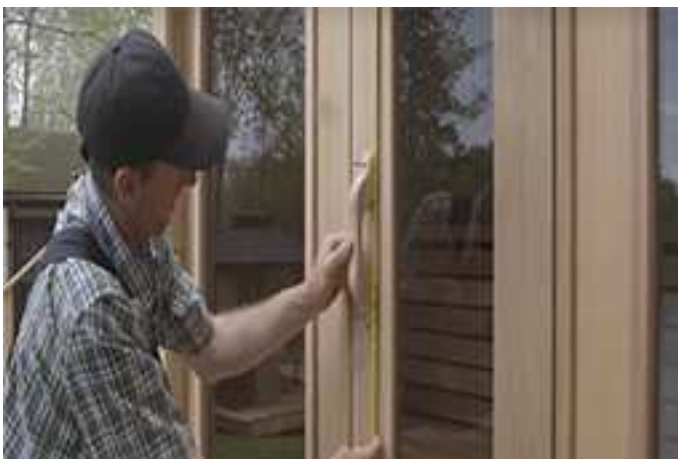
Measure to ensure handle is centered both ways and screw to door.