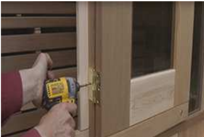
Repeat on other side through middle holes on top and bottom hinges.