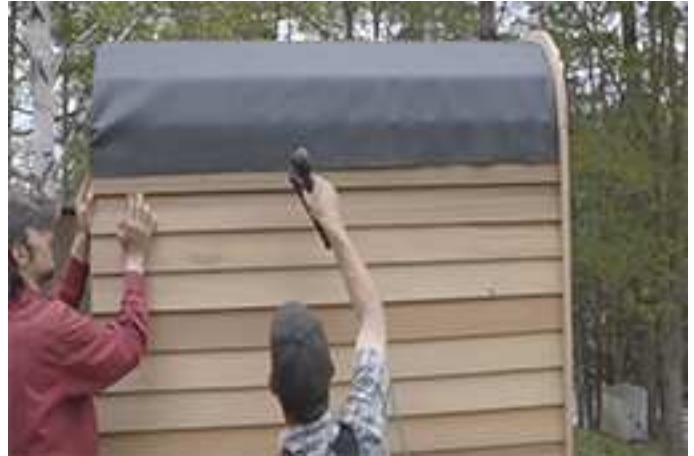
This protects the sauna from getting water between the siding and the staves.