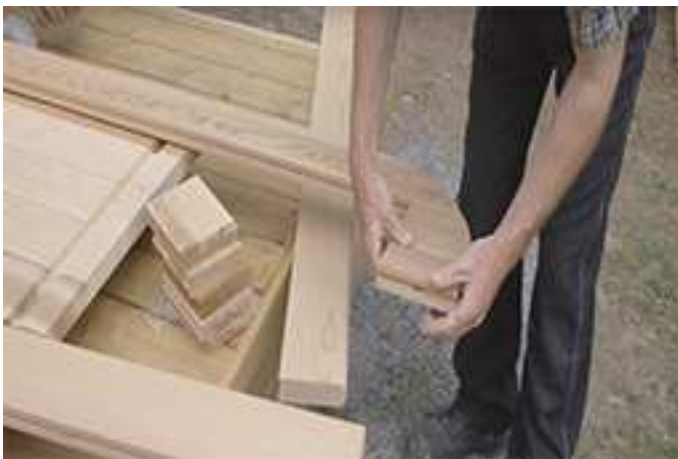
Slide threaded rod through side stave as you continue to add the small top pieces.