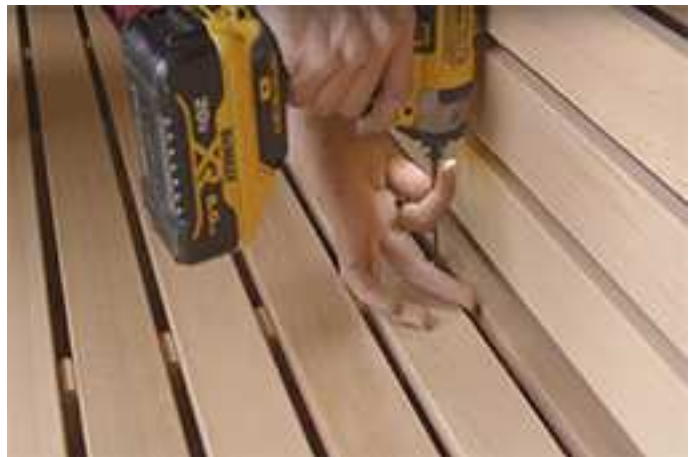
Repeat process to secure bottom bench to bench support.