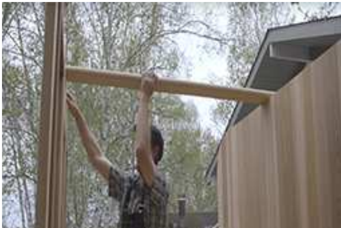
Use any stave to brace the front and back walls.